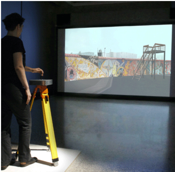
Virtuelle Mauer/ReConstructing the Wall interactive 3D installation © T+T Tamiko Thiel & Teresa Reuter, 2008

The VR installation Virtuelle Mauer/ReConstructing the Wall is an interactive, kinesthetic and immersive encounter that will give users a sense of how it was to live „in the shadow of the Wall.“ The virtual artwork is installed on the hard drive of a Windows PC. The image of the virtual world is projected life-sized via a video projector onto a 3m x 5m (~9'x15') screen. Sound from the virtual world is heard via 2 stereo PC speakers to the right and left of the screen. Users move through the interactive 3D world via a simple joystick. (See Appendix for detailed technical specifications.)